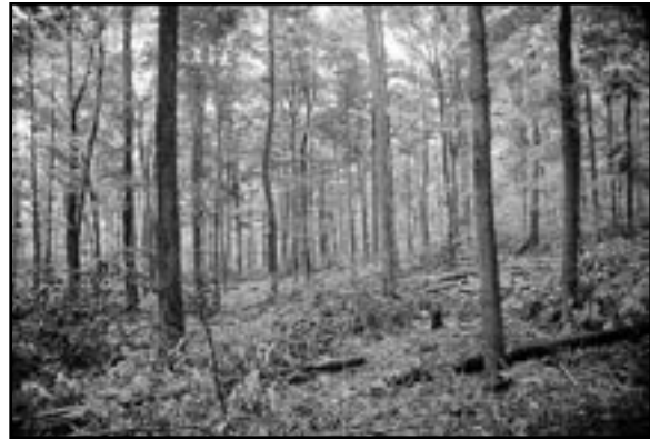
FIGURE 9.—A 70-year-old, even-aged northern hardwood stand will support operational thinning that regulates spacing and density, and concentrates the growth on high-quality dominant and codominant trees.

Recently summarized data show that repeated diameter-limit cutting left the stands with fewer large trees, less sawtimber volume and growth, and one-half as much regeneration as selection cutting (Kenefic and others 2005). In fact, diameter-limit cut stands had virtually no medium to large sawtimber after the first entry, while the amount of sawtimber increased steadily in the selection stands (figure 10). After