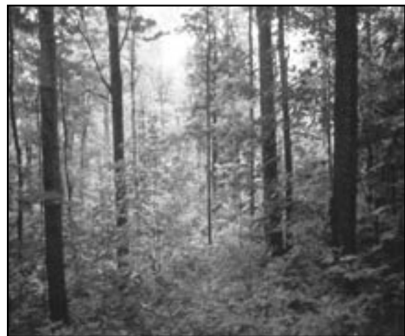
FIGURE 7.—Post-cut conditions in diameter-limit (top) and selection-system stands.