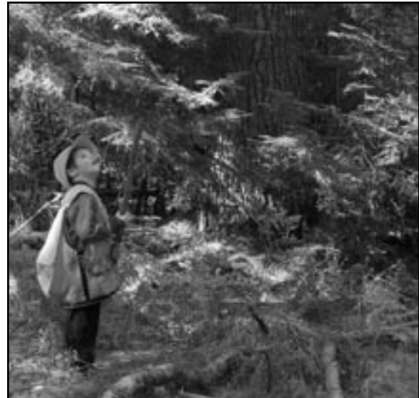
FIGURE 12.—Landowners' values vary, but often include protecting the forest for future generations.

Any of these strategies would give landowners a viable alternative to diameter-limit cutting while providing income in the short term. The best choice depends on the landowner's interests and the condition of the stand (figure 12). Good planning usually will uncover a strategy that avoids the long-term pitfalls of diameter-limit cutting, while still providing many landowner benefits. Deliberate efforts are needed to monitor conditions in the forest, maintain appropriate levels of stocking, enhance the growth and vigor of desirable species, and regenerate new trees and new forests when the current ones mature or no longer serve the landowner's needs.