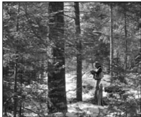
FIGURE 4.—Examples of even-aged (top) and uneven aged northern conifer stands.